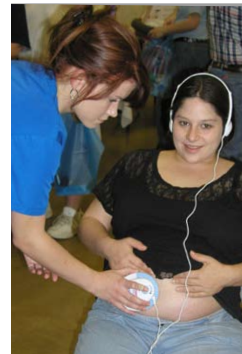
"Oh Baby! It's a Baby Shower" reaches many expecting mothers from throughout the region. Here, a young mother has the opportunity to listen to her baby.

The Northeast AHEC plans to provide an even more comprehensive resource event in 2007. An expanded informational area, a more accommodating facility, and an extended question and answer session are goals for next year's event.