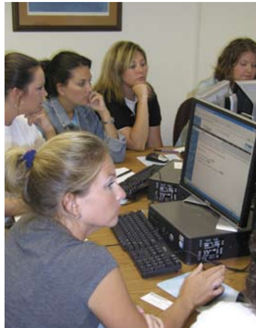
Physician Assistant students learn database research techniques.