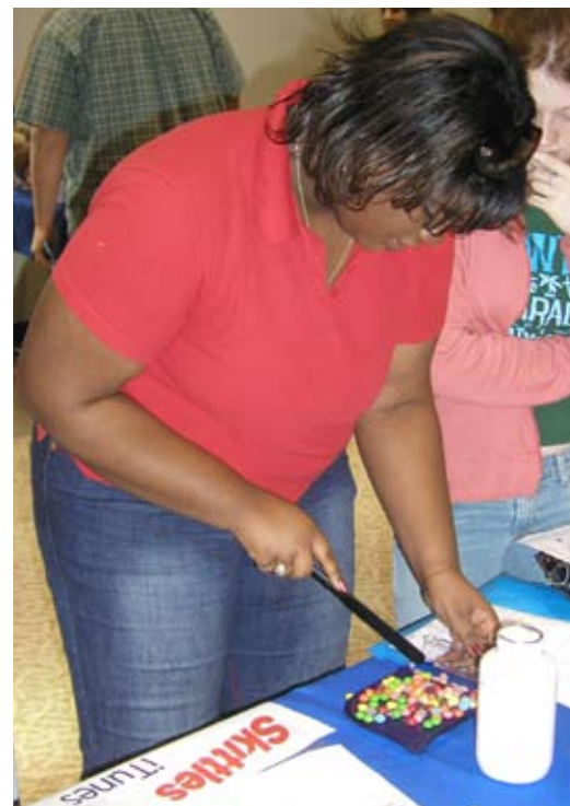
Using Skittles, the pharmacy station simulated counting, packaging, and labeling of medication.

In its first year, more than 130 students participated in the HOW Workshop. The Northeast AHEC hopes to expand the workshop in the upcoming year by growing both the attendance and booth participation in 2007.